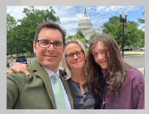
The directors and film participant, Curtis, in Washington, DC during the film premiere

INCLUDES TALK WITH FILMMAKER VIA ZOOM, ADDS $500